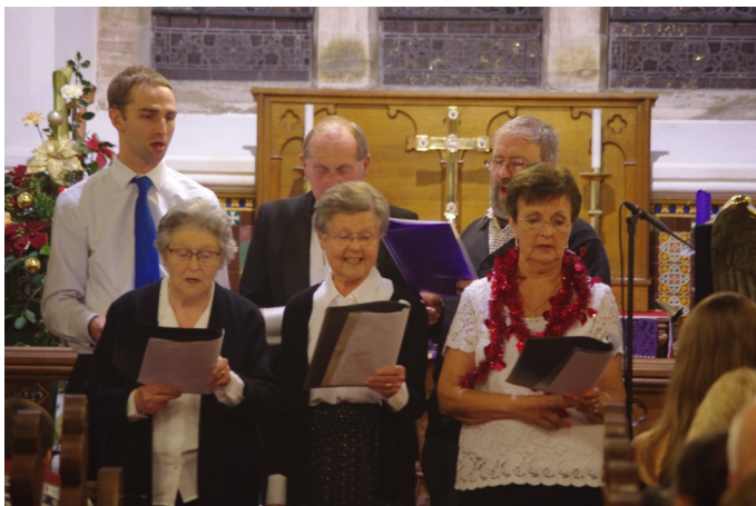
Pictured above: Members of St Hilary's congregation joined with some of the musicians to sing at the Christmas concert at St Hilary's.