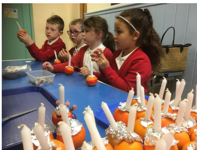
Pictured above: Children at Ysgol Bodafon make Christingles for a service at St Paul's. There were some very creative arrangements of the sweets on the sticks, and we are impressed to report that none were eaten!

So, for 2019, please join with the children as they pray and think about the way forward for their prayer boxes to nurture their needs, both personally, as a school and as a community. And pray also that on their journey through school, with the prayer boxes, with school assemblies, and also through meetings with people from local churches, the children's faith will strengthen and increase and become a firm foundation and anchor in their own lives.